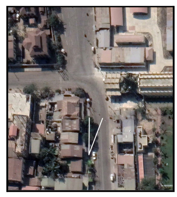
Figure 7b: Satellite image and graphic representing the perspective of Figure 7a.