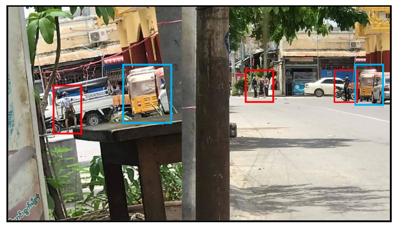
Figure 7a: Identification of armed figures on July 27, 2021 at the location where Thu Thu Zin was active and killed (same date).