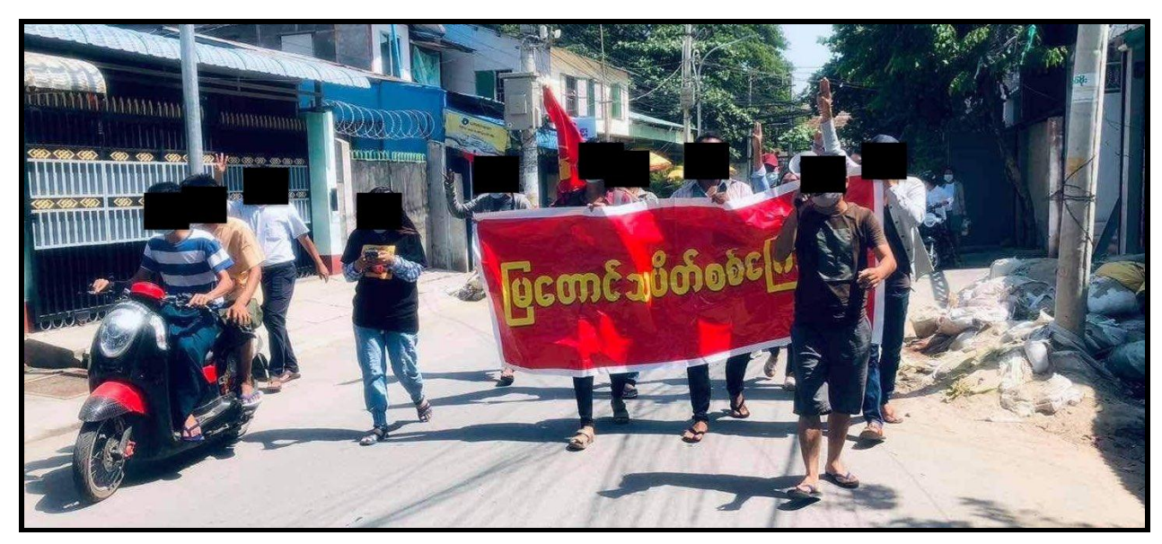
Figure 1: Image of the protest movement and their distinct flag (Mya Taung Strike Front).

The information collected and archived by Myanmar Witness indicates that Thu Thu Zin was part of a small pro-democratic, anti-coup protest movement in Mandalay. The same group would often march in crowded areas in suburbs or markets in Mandalay, showing the flag that can be seen in Figure 1 below. Images of the group can be seen on social media on May 22, 2021, June 19, 2021 and July 26, 2021 featuring a woman who looks strikingly similar to Thu Thu Zin.