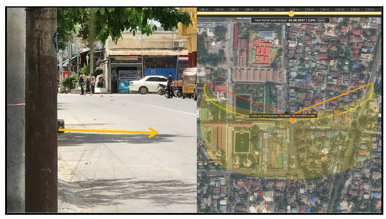
Figure 7c: Chronolocation of image showing the presence of security forces at the location where Thu Thu Zin was killed. Arrows show the direction of shadows

According to the shadows on the above image, it was taken around midday on July 27. This is likely to be moments after Thu Thu Zin was last photographed alive.