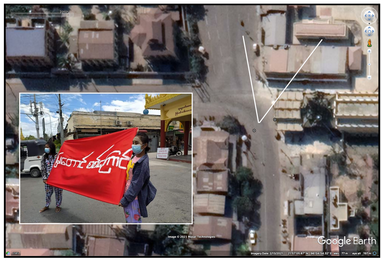
Figure 3: Thu Thu Zin heading the Mya Taung protest column with a flag. White lines indicate the line of sight from the photo, showing Thu Thu Zin at the point where the lines converge.

When the protest column reached the eastern gate of Mahamuni Pagoda at around 12pm, eyewitness testimony in <u>Progressive Voice</u>, <u>Myanmar Now</u> and <u>KhitThit News</u> reported that she was shot in the head and killed when security forces opened fire at the protestors. Two other protestors were also reported to have been shot as part of this incident.