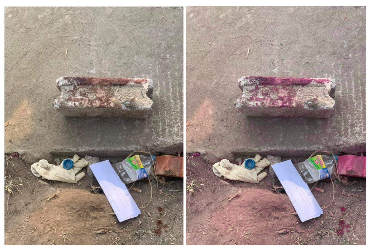
Figure 12: (Left) the original photo; (right) Magenta-optimised photo to highlight blood stains. Brick found next to Angel's grave with bloodstains on it and on the ground. The blood stain pattern is strongest on the long edge and may have been from impact. This suggests that the brick may have been used to crack open her skull. Also note the surgical gloves.

The military announced on Myanmar Radio and Television (MRTV) and Myawaddy News (MWD) that neither they, nor the state police, were responsible for Angel's death. The police also released a statement through GNLM that they had determined that the bullet had not come from a police bullet, saying: "The lead piece found in the head was a type of ammunition that can be fired with a shotgun with 0.38 round of ammunition...", (Figure 13) adding that this ammunition is "different from the riot control bullets used by the Myanmar Police Force". The possibility of Angel's body having been tampered with, potentially using a brick on her head, also coincides with this state narrative focus on bullets used in the shooting, as they would be targeting her head where it might be possible to retrieve a bullet and dismiss the state narrative determining no security force accountability in Angel's death.