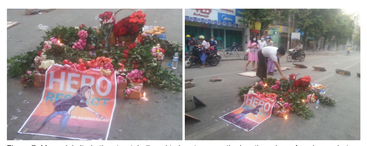
Figure 7: Memorial site in the street, believed to be at or near the location where Angel was shot.

Later, images appeared of a memorial site in the middle of the street, not far from where the protests happened. This might indicate that she died or was shot here, between the barricade and the images of Angel wounded on the back of a motorbike.