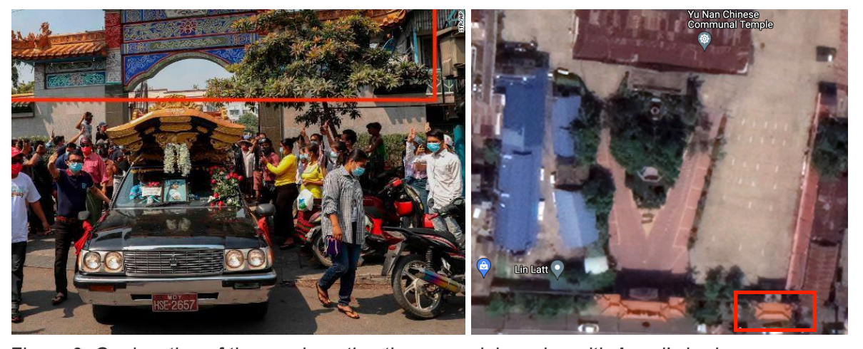
Figure 9: Geolocation of the car departing the memorial service with Angel's body.