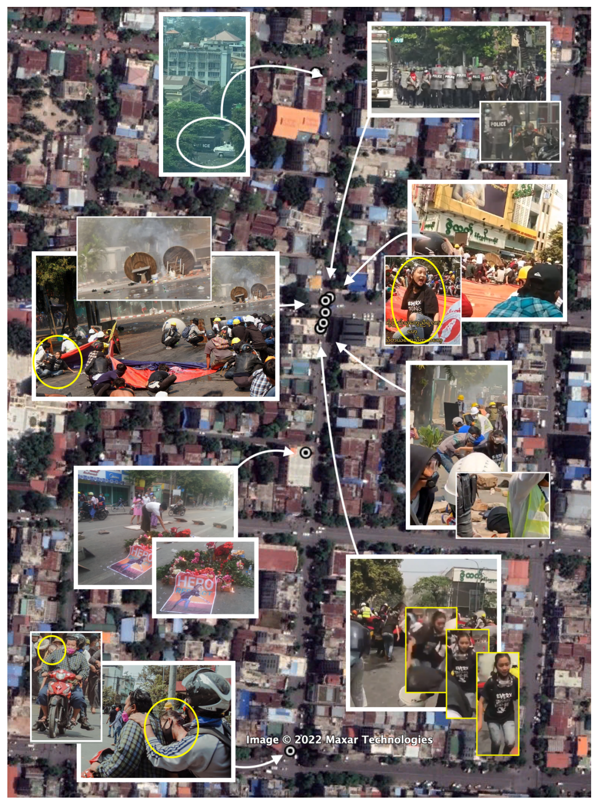
Figure 3: Breakdown of the geolocation of user-generated content concerning Angel.