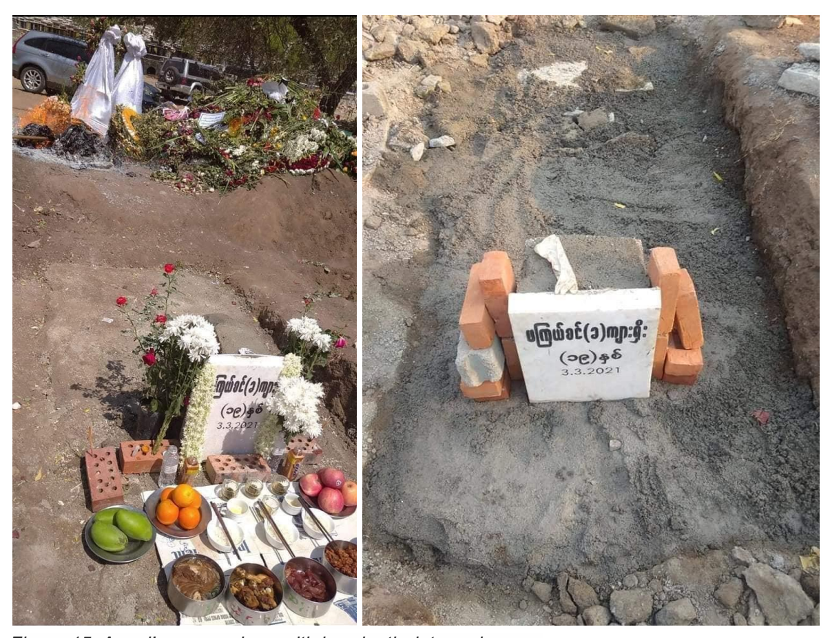
Figure 15: Angel's grave, along with her death date and name.