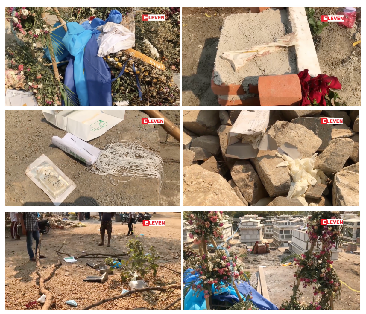
Figure 11: Evidence left after her grave was tampered with, including surgical equipment and gloves.