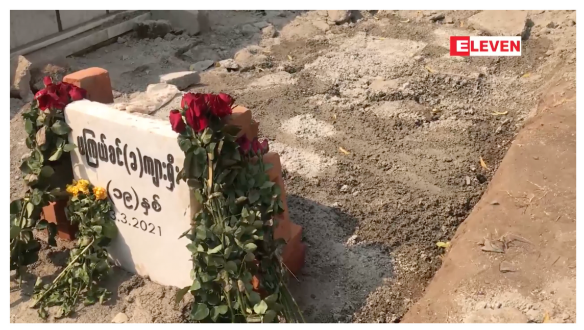
Figure 10: Angel's grave seen covered with cement after being tampered with in the night.

to conduct an autopsy and determine Angel's cause of death. They claim they had gained permission from a judge, but the specifics were not volunteered. According to CNN an eyewitness saw around twenty people with guns enter the graveyard between 1600 and 1900, implying suspicious circumstances and explicitly stating that a military vehicle was present. The person at the gate who let them in was allegedly 'not [to] inform anyone about it" according to CNN's coverage.