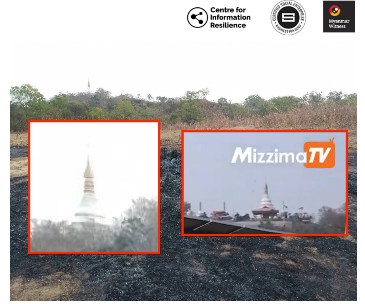
Figure 2: Cross-referencing of pagoda with Mizzima TV images

The pagoda seen in the above images can be located to the outskirts of Thit Seint Gyi, at coordinates: 22.421225, 95.951197. Features seen in those images match what is seen on satellite imagery at that location (Figure 3).