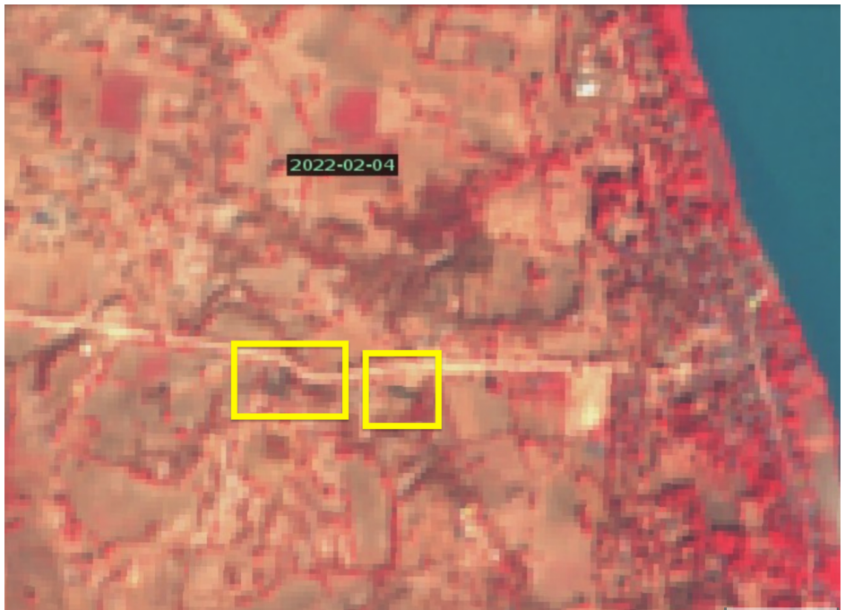
Figure 5: Satellite imagery of the location from February 4 2022