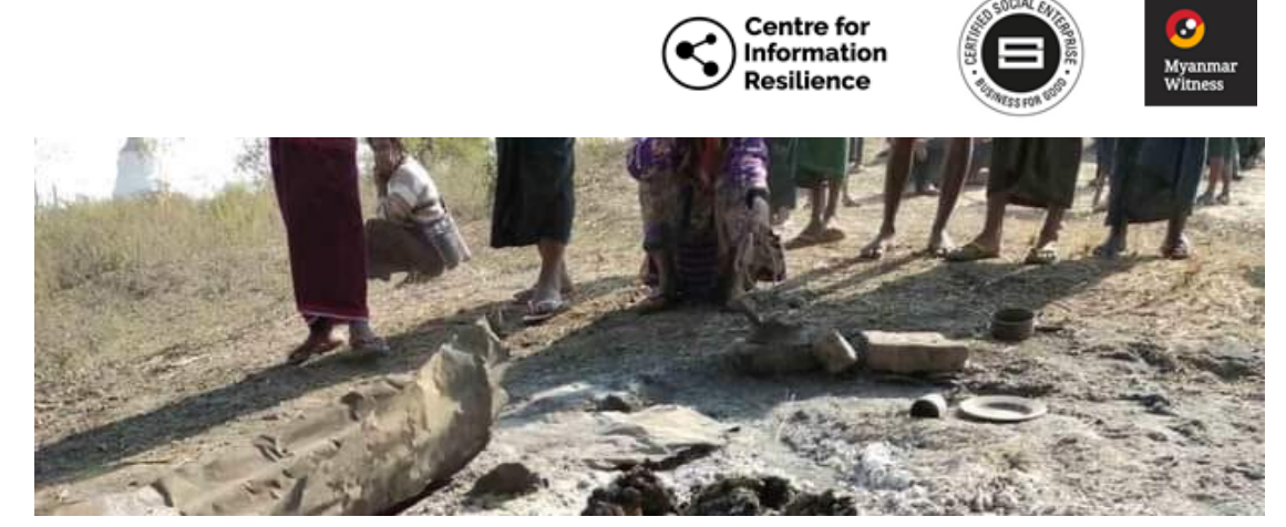
Figure 8: Image uploaded to social media on February 4, 2022 (cropping by Myanmar Witness).

This pagoda is seen here on <u>Google Maps images</u>, and can be geolocated to <u>this location</u> about 500m away from where the burnt areas have been identified.