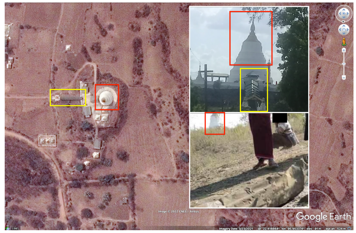
Figure9: Geolocation of image uploaded to social media on February 4, 2022.

This pagoda is seen here on <u>Google Maps images</u>, and can be geolocated to <u>this location</u> about 500m away from where the burnt areas have been identified.