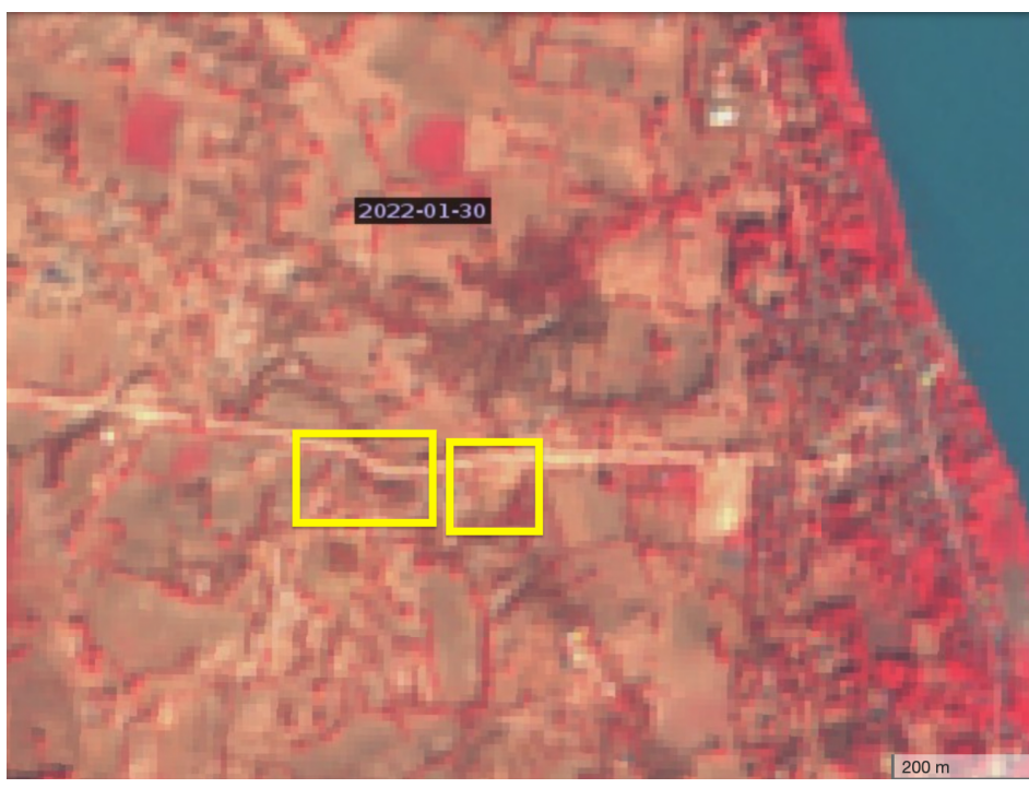
Figure 4: Satellite imagery of the location from 30 January 2022