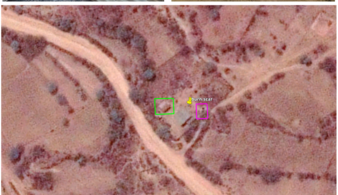
Figure 7: Geolocation of burnt sheds

Further images identified by Myanmar Witness that were uploaded to social media by a private user show what appears to be bones in burnt areas alleged to be near the village. This report will not link to that social media account, however the originals will be made available upon request.