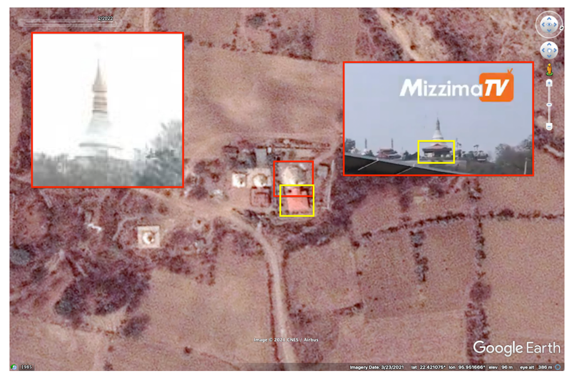
Figure 3: Geolocation of pagoda using satellite imagery

By using <u>Sentinel-2 satellite imagery</u>, Myanmar Witness has been able to identify burn scars where fire has 'charred' the land, indicating a likely location of where the bodies were burned near the geolocated pagoda. The verification of that burn scar can be seen below in the imagery from January 30 2022 (Figure 4) and February 4 2022 (Figure 5).