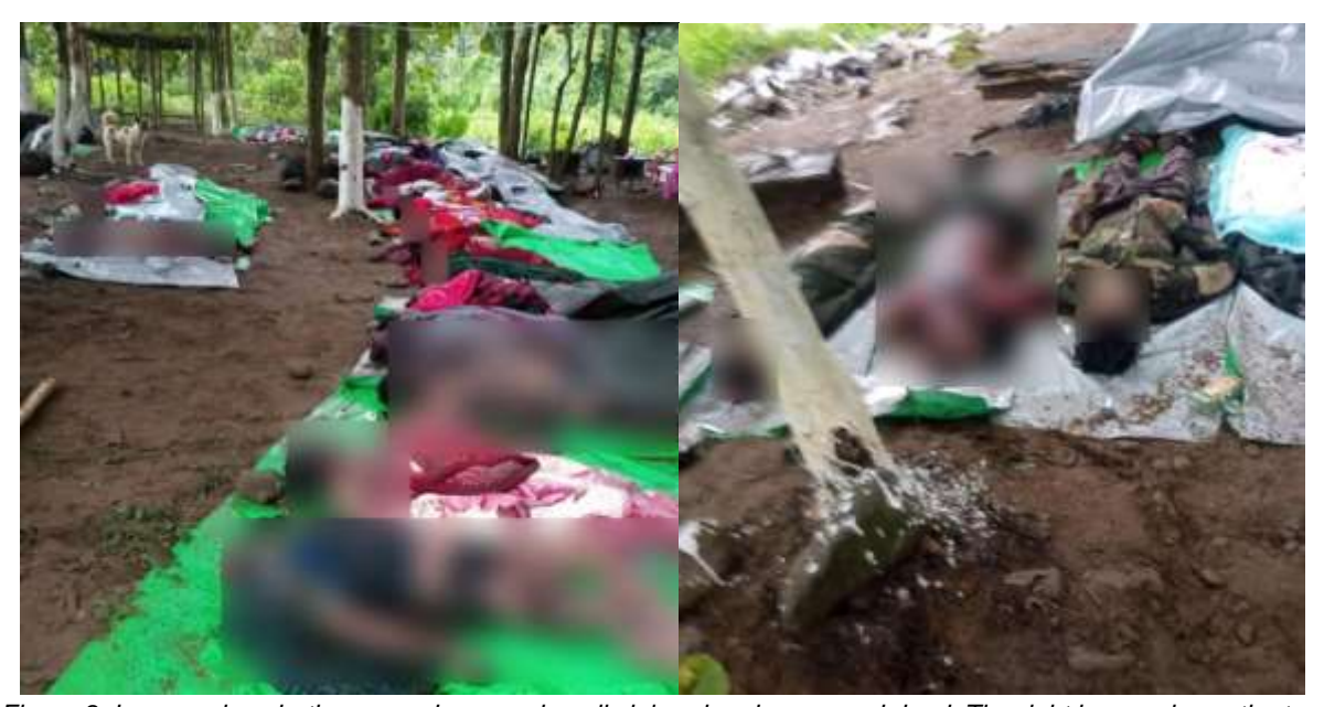
Figure 8: Images show both men and women heavily injured and presumed dead. The right image shows the two individuals in army fatigues.

Myanmar Witness has analysed images that allegedly show dead civilians from this case uploaded by anti-military media outlet <a href="Manau Voice">Manau Voice</a>. These images show at least 30 corpses - with two in distinctive uniform while the rest appear to be plain-clothed or unknown (Figure 8). However, Myanmar Witness cannot fully verify the number of dead bodies due to a lack of footage and this footage has not yet been geolocated to verify if the images are from this location.