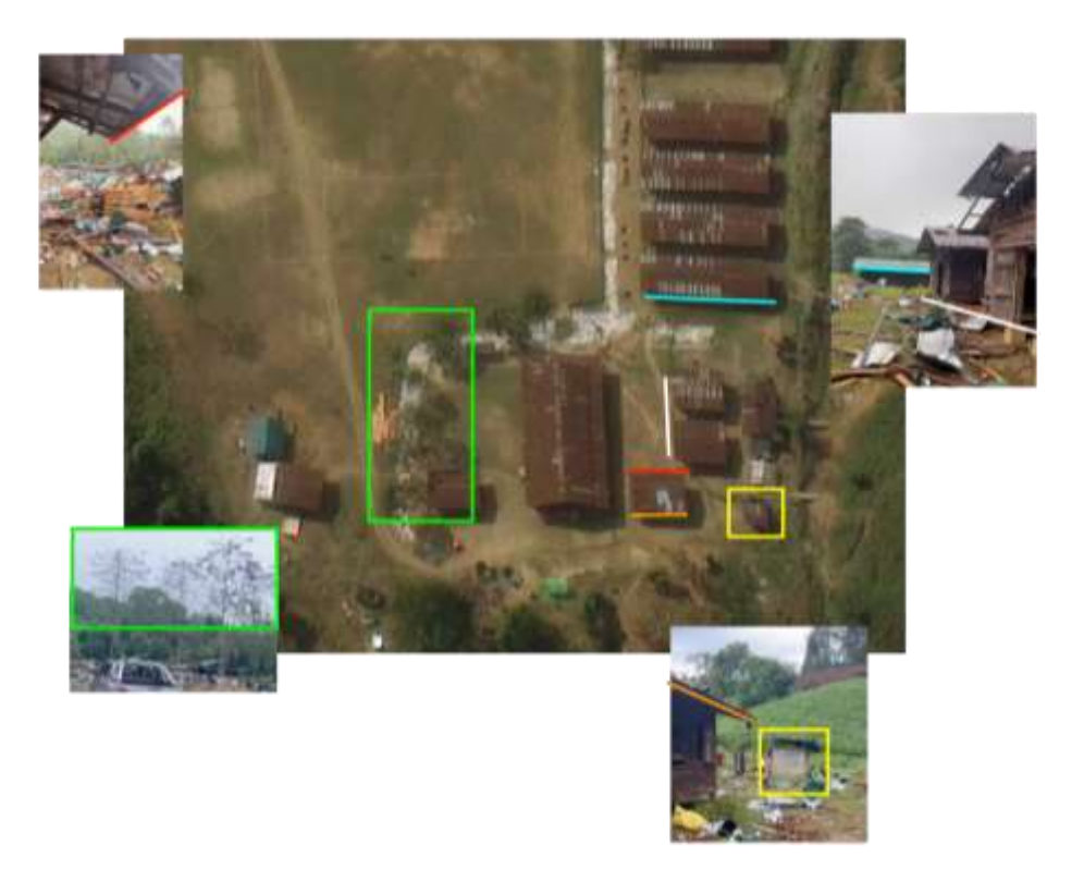
Figure 2: Geolocation details of the event.