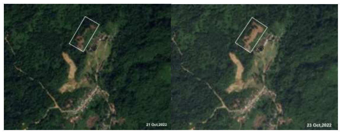
Figure 4: Planet imagery showing a difference in the area between 21-23 October 2022.