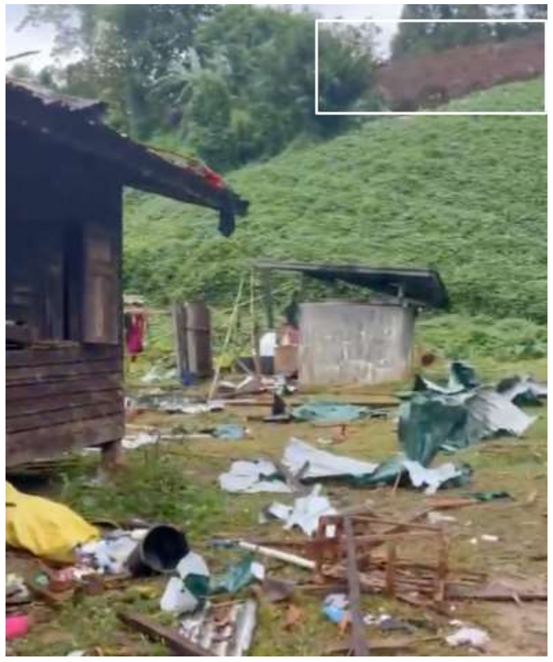
Figure 5:The cleared area of an elevated level of land shown in the footage.