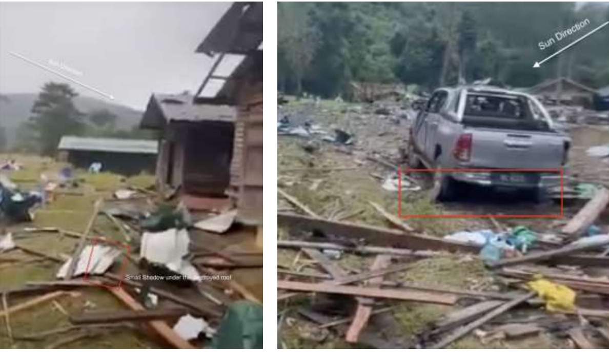
Figure 6: Sun direction labelled and the shadow appearing under the objects highlighted with a red box.