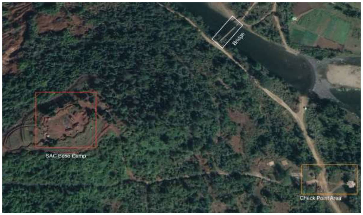
Figure 9: The bridge, highlighted with a white box, which could have been the site of a military roadblock which prevented medical aid from reaching the injured. However, this claim has not been verified. The red box demonstrates the area geolocated by Myanmar Witness.