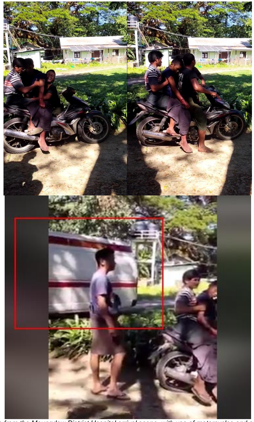
Figure 3: Footage from the Maungdaw District Hospital arrival scene, with use of motorcycles and an ambulance used for delivering injured villagers (seen in the red box on the right). (Sources: For right image: <a href="24">24hour information</a> myanmar, for left image: <a href="24">Western News Agency</a>).