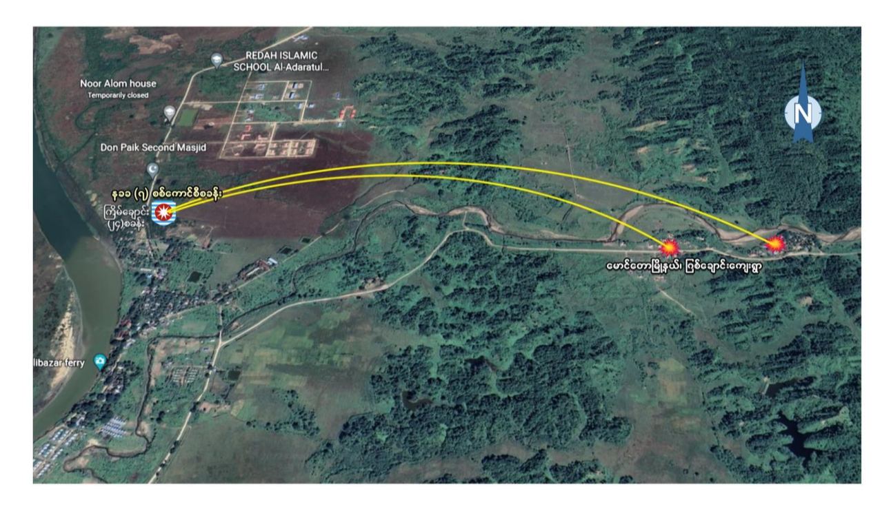
Figure 8: visual satellite imagery with claims of the attacks originating at the SAC Rang Chao (24) Camp, as well as the impact locations in Maungdaw township on 16 November 2022.

The visualisation posted by the Arakan Army puts the location of the strike at Kyein Chaung village, and the origin location as နှခခ (၇) Border Guard Police Unit 7. It also uses the phrasing of "စစ်ကောင်စီစခန်း", meaning 'military camp'. This reported location is circa 2.5km away from the geolocated images of the patients arriving at the medical facility.