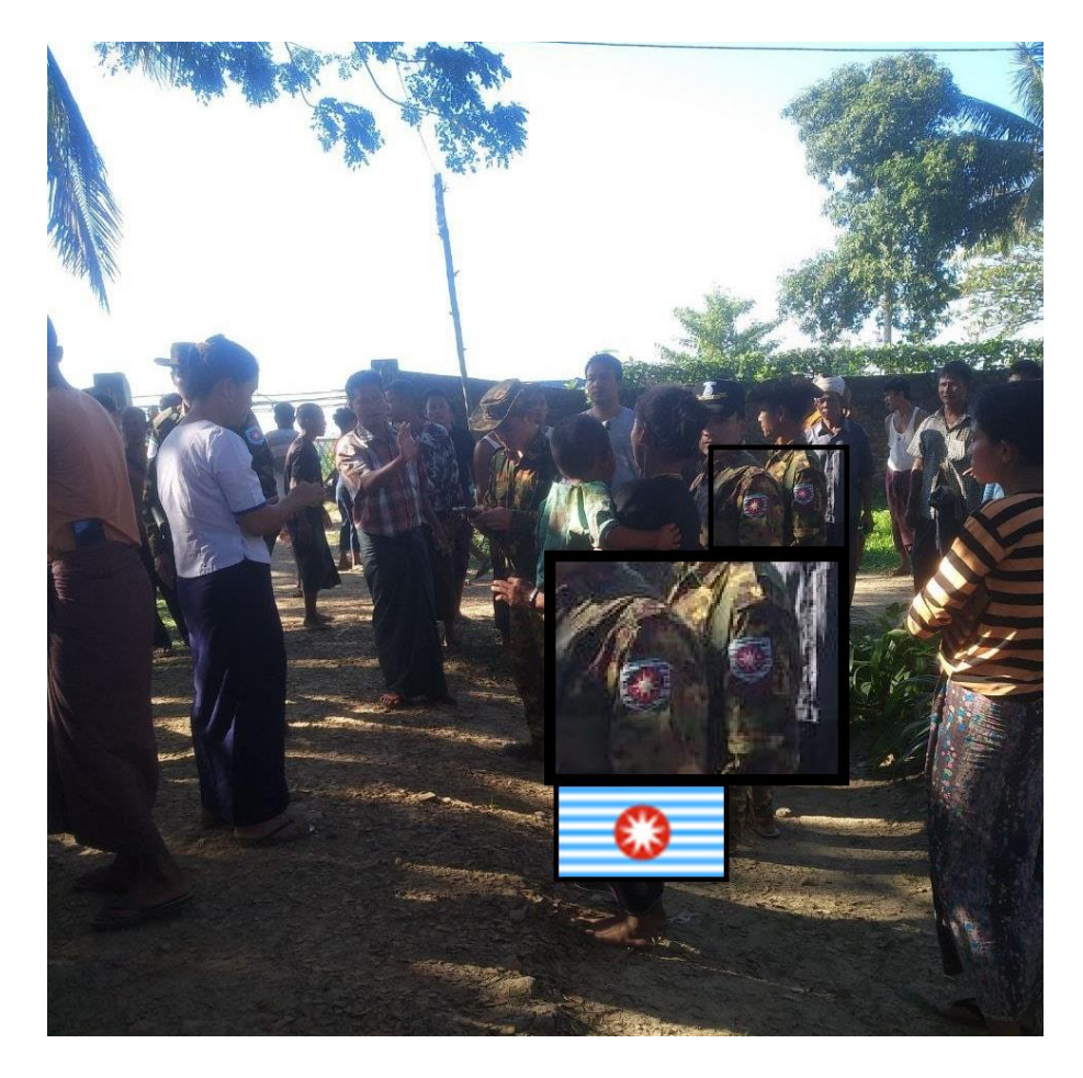
Figure 11: The zoomed in focus of the military insignia, showing the presence of Rakhine State's 5th Operation Command's Taungup City troops (တောင်ကုတ်), allegedly trying to bribe locals at Kyein Chaung Hospital, 16 November 2022.