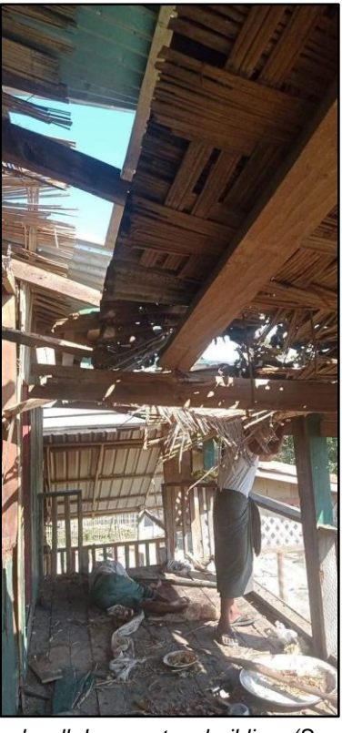
Figure 7: Imagery claimed to be from Gyit Chaung village, showing roof and wall damage to a building. (Source: Both redacted due to privacy concerns

The <u>Arakan Army</u> website shared a visual map of the alleged locations of interest for this incident, including the local SAC base (Rang Chao (24) Camp), where they claim the attack originated, as well as the two alleged impact locations in Maungdaw township. This visualisation is shown in figure 8.