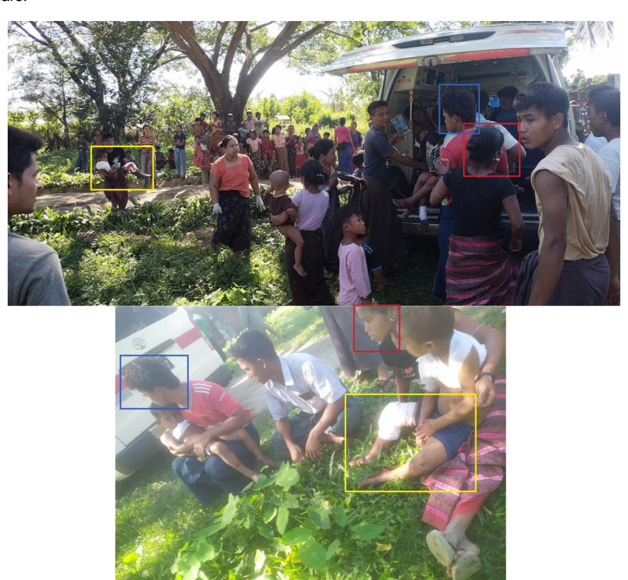
Figure 4: Footage of what appears to be the arrival scene of those injured and several onlookers, with a focus on the woman marked in red, the minor in yellow and another man that appears in both images in blue. (Upper image Source: Development Media Group) (Lower image Source: Arakan Princess Media)

The image of the ambulance appears to show movement into or out of the vehicle - people are wounded, the crowd is watching, a casualty is being treated, people are crowding inside the ambulance (shown in figure 4). There is also a man who carries an injured child, walking towards the ambulance. In the lower image of figure 3, a child is seen sitting on the lap of a woman, right by the ambulance (with its trunk closed). In the upper ambulance image, the same woman seems to look inside it, while a man carries the child in this direction. It is most likely that the medical facility is a small clinic, where victims arrived to receive initial and immediate medical care. Reports note some of the victims were later transported to a bigger hospital for more advanced care.