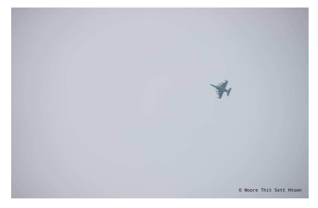
Figure 10: image taken by The Cobra Column, a KNLA (Karen National Liberation Army) group, alleged to document a Yak-130 participating in a military operation on 11 April, 2022.

• 11 April 2022 – The Cobra Column also shared a high-resolution image which Myanmar Witness has identified as a Yak-130. The image is alleged to depict the aircraft participating in a military operation in the early hours of 11 April 2022.