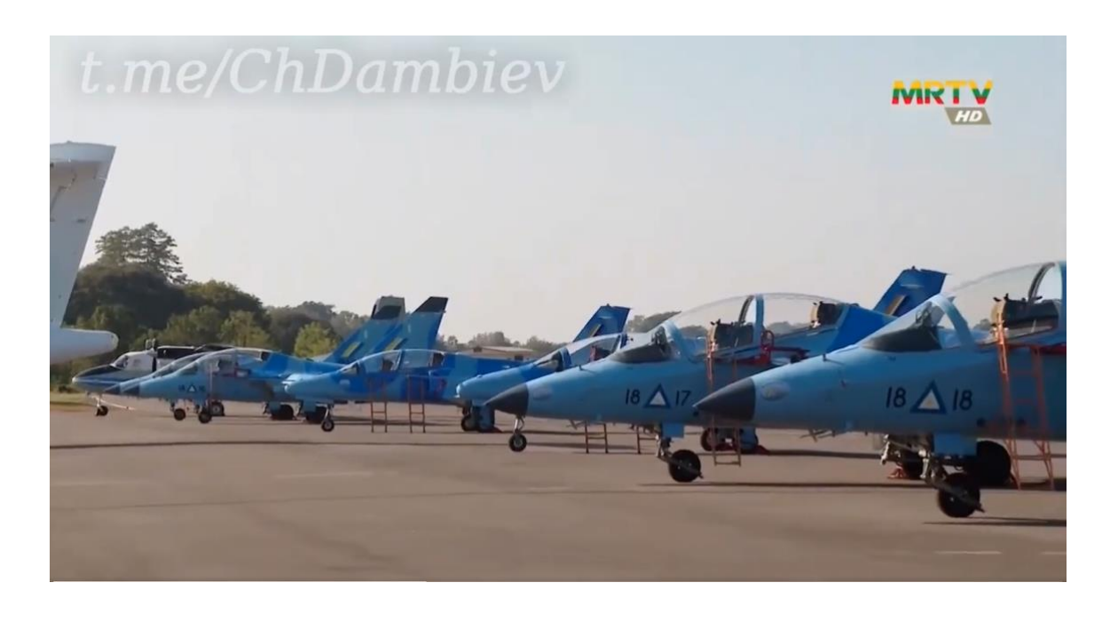
Figure 4: screen capture from the same video showing fourYak-130s. Note the number below the canopy on each aircraft.