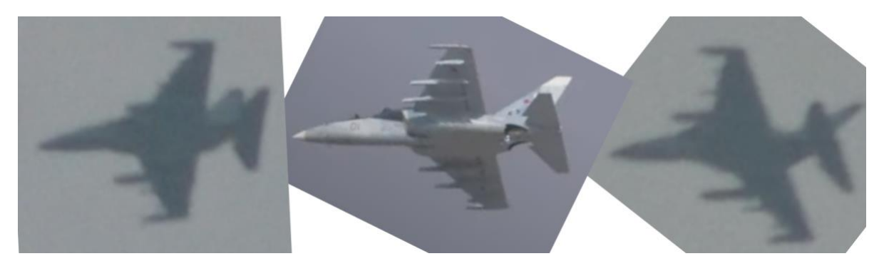
Figure 1: 1st and 3rd images show a Yak-130 in flight over Loikaw area, Kayah State, on 21 February, 2022, in confidential footage shared by The Free Burma Rangers and analysed by Myanmar Witness. The central picture is for reference purposes.

Initially designed as an advanced jet trainer, the Yak-130 has since been marketed as a light attack aircraft with a combat load of 3,000kg. It is manufactured by the <u>Irkut Corporation</u>, at the Irkutsk Aviation Plant, Irkutsk, Russia. Myanmar Witness has seen evidence that Myanmar <u>signed</u> a <u>purchase agreement</u> with <u>JSC Rosoboron</u> export on 22 June 2015 for Yak-130s. The Myanmar military regime received six aircraft between 2015 and 2016 and <u>another six</u> between 2018 and 2019.