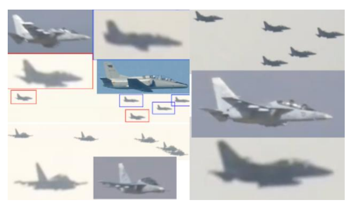
Figure 8: still image from the 77<sup>th</sup> Arms Forces Day parade in Maypyitaw showing Yak-130s and K-8s. Stills from the MAF parade's live feed on the left, compared with footage from the Dubai Airshow (right).

• 27 March 2022 – During the 77th Armed Forces Day military parade in Naypyitaw (နေပြည်တော်), Myanmar, five Yak-130s were spotted flying overhead together, as well as an additional two Yak-130s (outlined in red) with three Chinese-made K-8s (outlined in blue). The parade has historically been used by the Tatmadaw to showcase their best and most-prized weapons to the world.