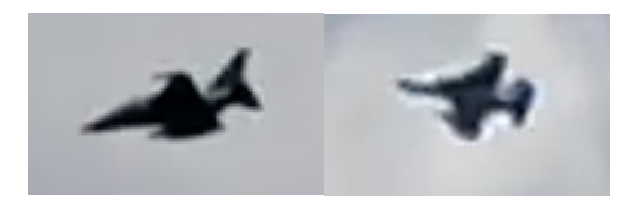
Figure 12: Yak-130 seen during ground attack.