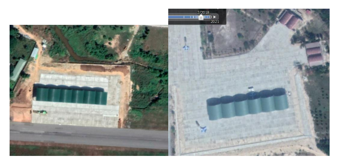
Figure 7: Google Earth Imagery showing hangers at Hmawbi Airbase (left) and Mandalay Airbase (right)

• The six hangars close to where the Yak-130 is spotted (20.166575, 94.967130; Figure 7, left image) were built in November 2021 - less than one month prior to the delivery of six Yak-130s on 15 December 2021. This conclusion was drawn through an analysis of Google Earth imagery. These hangars appear to be of the same design and dimensions as those in the Mandalay (Θεος) airbase (21.682378, 95.985175; Figure 7, right image), where the Yak-130s are known to be stationed.