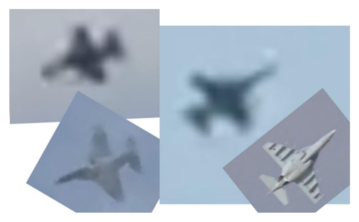
Figure 9: stills from Facebook footage assessed to show a Yak-130 overhead during a combat mission over Lay Kay Kaw. Stills from this video have been compared to stills from this reference video of the Yak-130.

• 11 April 2022 – The Cobra Column also shared a high-resolution image which Myanmar Witness has identified as a Yak-130. The image is alleged to depict the aircraft participating in a military operation in the early hours of 11 April 2022.