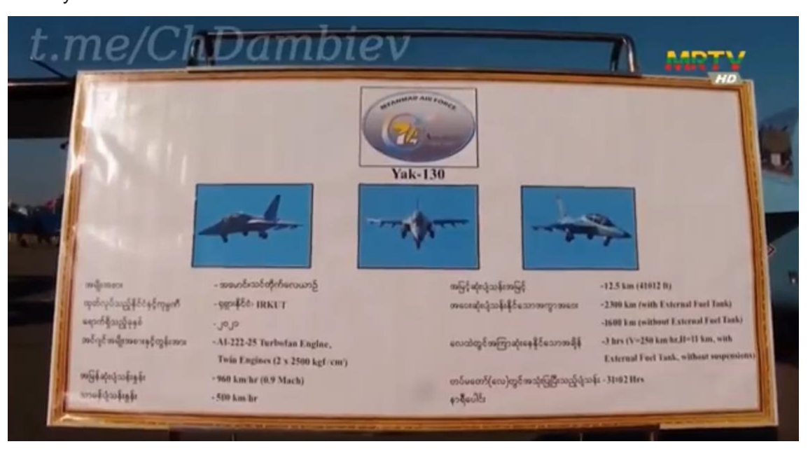
Figure 3: image capture from a video posted to Twitter and originally captured from a state-run tv broadcast featuring new aircraft commissioned into the MAF.

Following the February 2021 coup, Russia <u>voiced an intent</u> to continue to supply Myanmar with the Yak-130, as well as the more advanced export variant of the Su-30. This intent was confirmed by the provision of a <u>further six</u> Yak-130s which were unveiled on 15 December 2021 at Meiktila (မိတ္ထီလာမြို့) Airbase, Myanmar, as part of the MAF's 74th anniversary ceremony.