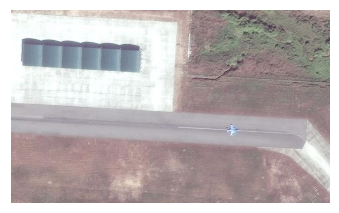
Figure 5: high resolution Maxar imagery of a Yak-130 at Hmawbi airbase