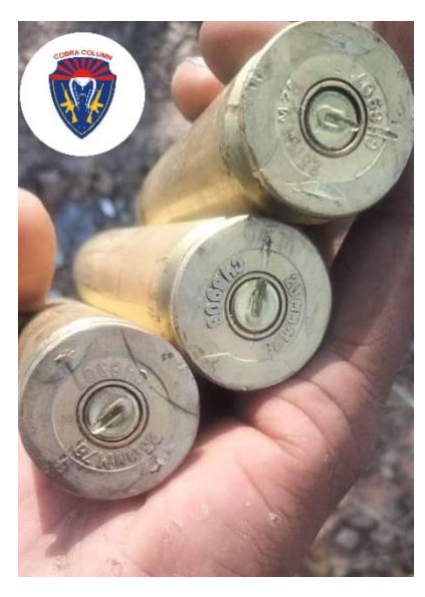
Figure 11: Image posted by The Cobra Column showing spent 23mm casings.

• 12 April 2022 – Images from the following day posted by the same KNLA group show spent 23mm ammunition casings collected on the ground. Myanmar Witness suspects that these rounds may have been manufactured in Serbia in 1989 based on the cartridge stamps – which indicate the manufacturing company's initials, year of production and calibre (however further verification is required to confirm this information). It is important to note that the Yak-130 is not the only aircraft in MAF inventory equipped with a 23mm cannon.