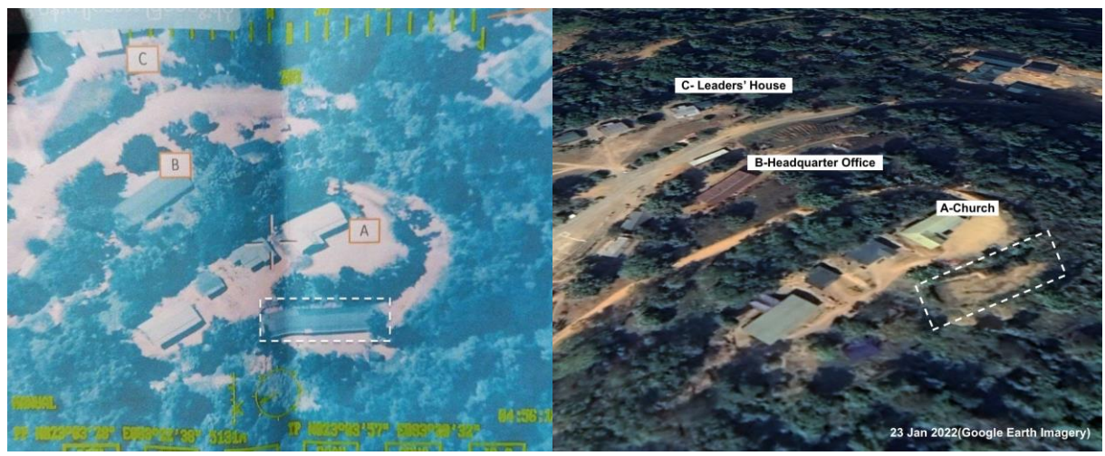
Figure 12: Image EA-354506 and Myanmar Witness analysis image.

One of the leaked images, labelled with serial number "EA-354506", had three sites marked with A-C. This serial number matched row 4 in the table, revealing that these sites are supposed to be church, headquarter office and leaders houses. These plans would need to have been made post-coup due to the fact that the building highlighted is a white, dashed, rectangular shape and a new addition on satellite imagery from January 2022.