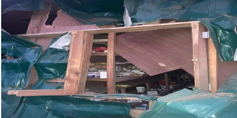
Figure 4: Images alleged to be of a medical facility warehouse, hit during the airstrikes on Camp Victoria.

Images of the CNF headquarters, uploaded by <u>News Media</u> groups covering the attack, show damage to roads, geolocated to 23.069124, 93.346662, and a CDF building, geolocated to 23.069562, 93.347362.