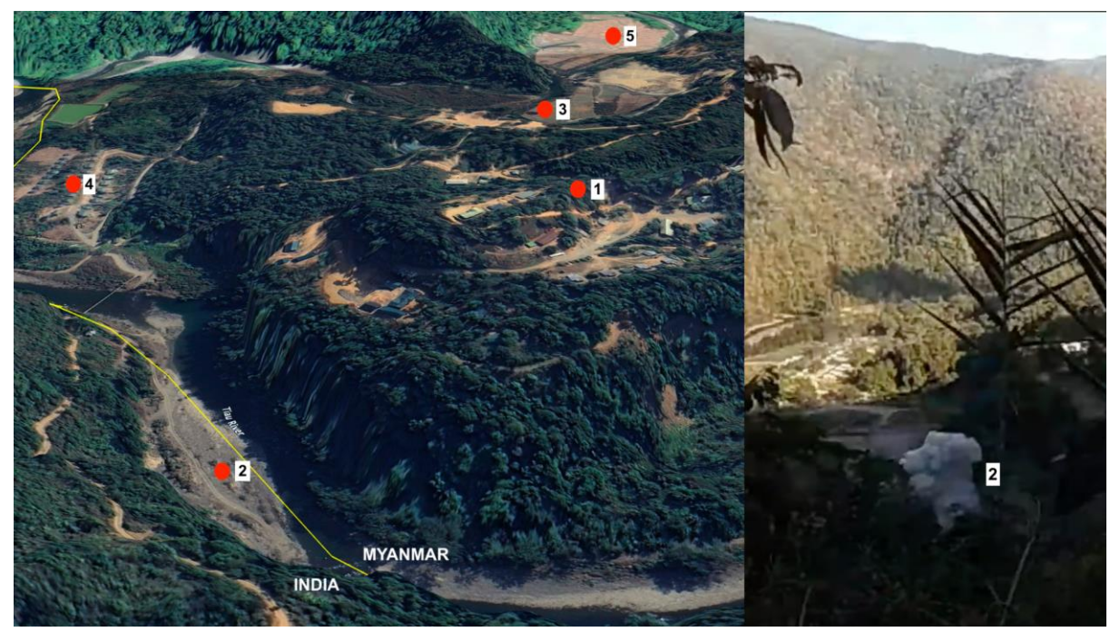
Figure 9: The yellow line indicating the border area and possible locations of where airstrikes hit around the border area. One hit - at around 1.04s into the video - could have been located on Indian soil.

<u>The Chin Journal</u> reported on 12 January 2023, that the location of the airstrike that hit Indian territory was very close to the riverbed and border between the two countries, with the location included in the images showing land that dips slightly - possibly indicating it has been hit - but this could not be geolocated. Regardless, this claim aligns with Myanmar Witness' geolocation