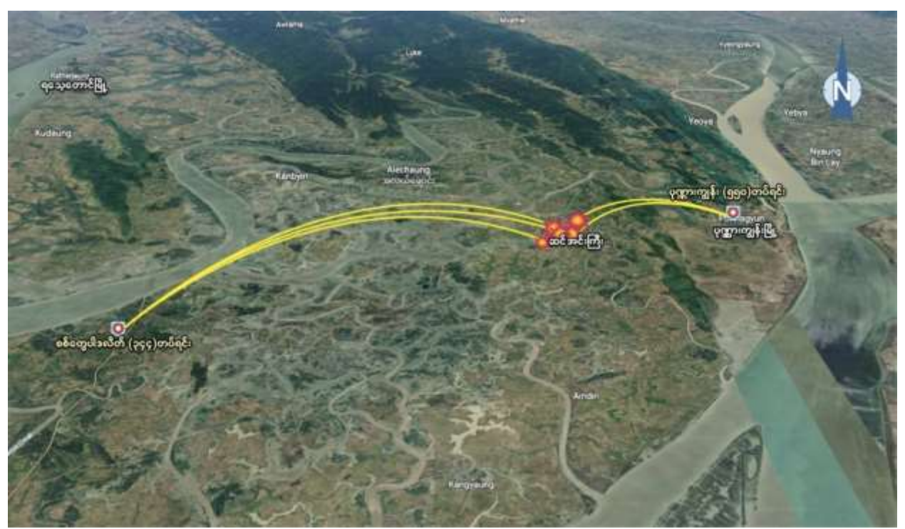
Figure 6: User generated map view of the ULA's claim of SAC troops firing into the village from two separate locations around the time of the raid in Sin Inn Gyi village, Ponnagyun Township, on 10 November 2022, leading to more casualties and injured villagers. (Source: redacted for privacy reasons).