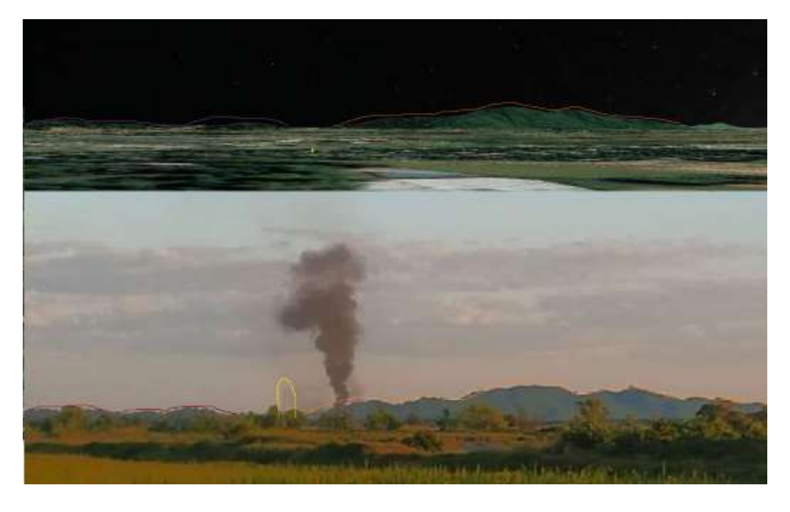
Figure 2: The top image is of satellite imagery showing geographical landmarks, such as the nearby mountain range matching up with UGC shared online showing smoke from an alleged SIn Inn Gyi village fire in the distance. (Source of bottom image: <u>Western News Agency</u>).