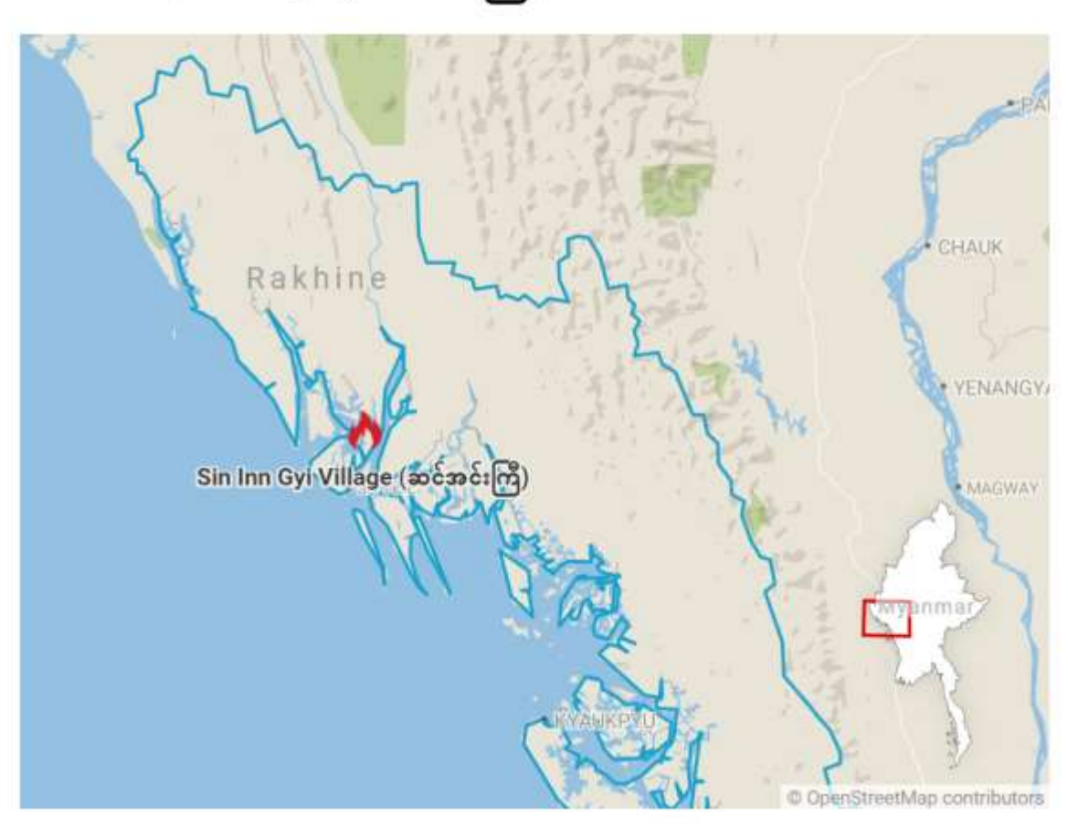
Figure 5: Map of Sin Inn Gyi Village (ဆင်အင်းကြီ), Ponnagyun Township, Rakhine State. (Map created using Datawrapper).

The ULA have claimed (source redacted for privacy reasons) that shelling and drone attacks from two separate locations occurred around Sin Inn Gyi village on 11 November 2022, shown in figure 6. These locations are allegedly occupied by LIB334 and LIB550.