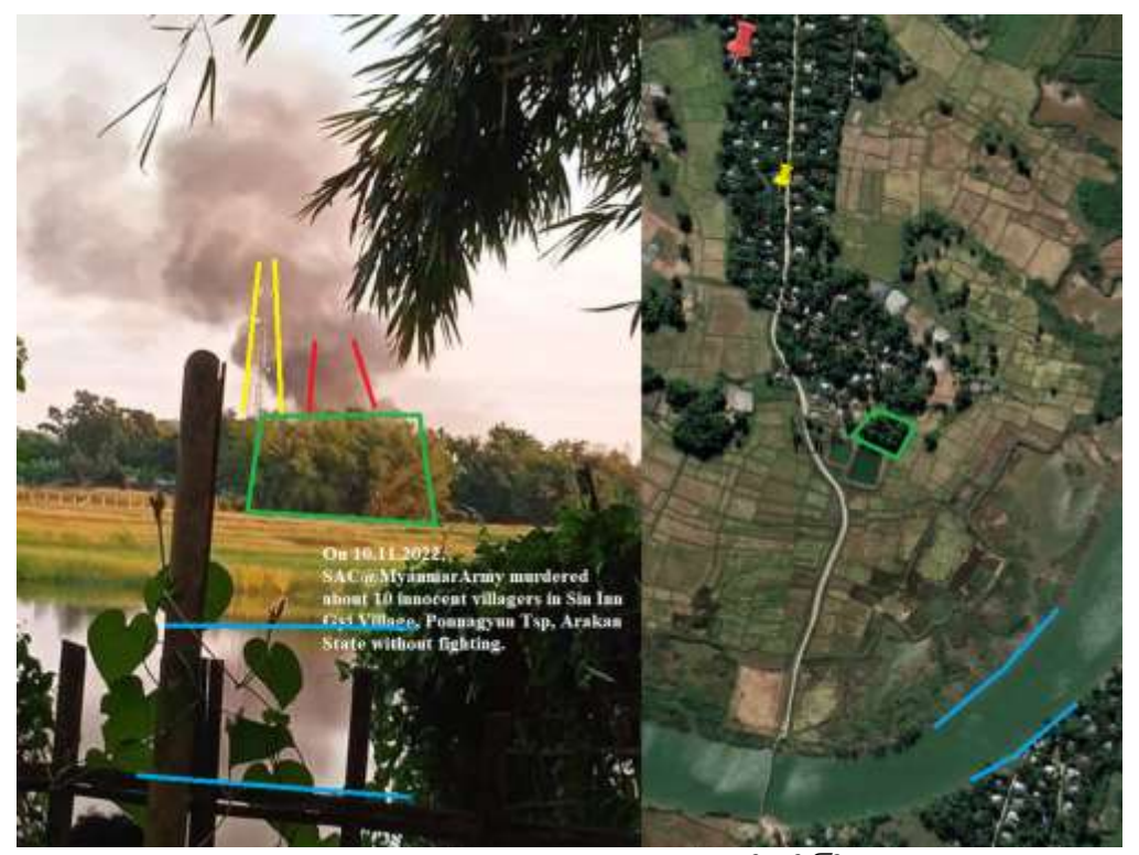
Figure 1: Geolocation of the alleged fire and attack on Sin Inn Gyi (ဆင်အင်းကြီ) villagers.