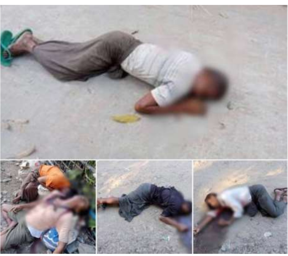
Figure 7: Graphic images of five victims and how they were discovered on 11 November 2022, the day after the attack on Sin Inn Gyi Village (ဆင်အင်းကြီ).