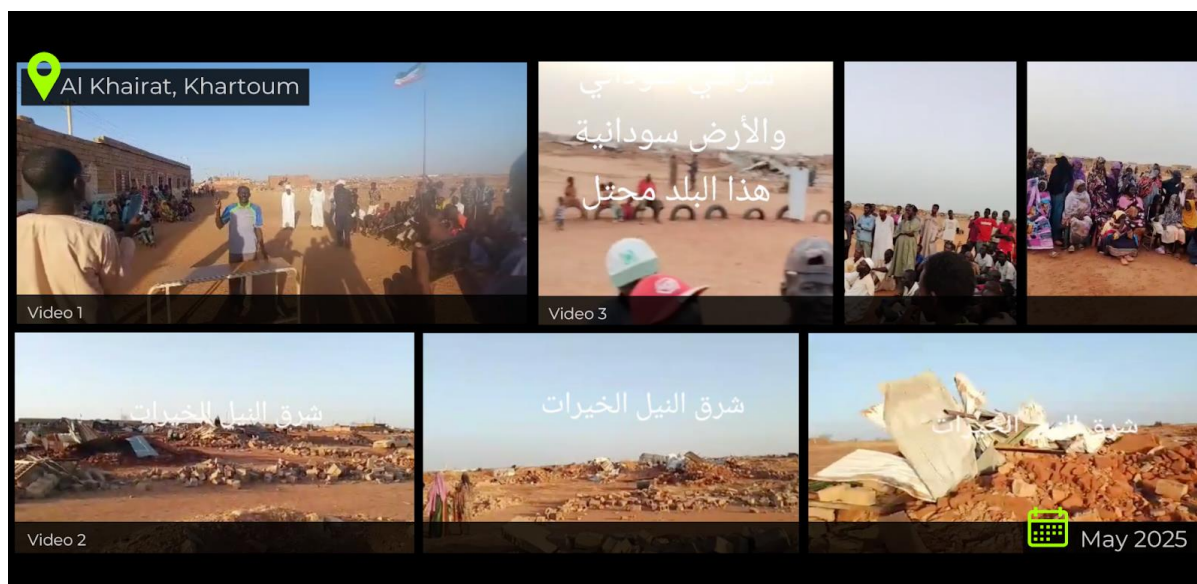
Figure 1: Still images from three verified videos showing destruction in the Al Khairat neighbourhood, Khartoum, in May [15.519720826561388, 32.72450023187179; 15.51769901, 32.72528593; 15.514422, 32.723961]