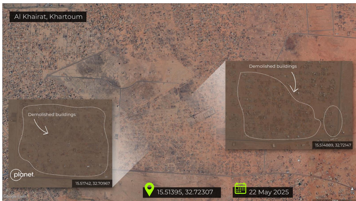
Figure 2: High-resolution satellite imagery from 22 May showing destruction in the Al Khairat neighbourhood, Khartoum [15.51395, 32.72307]