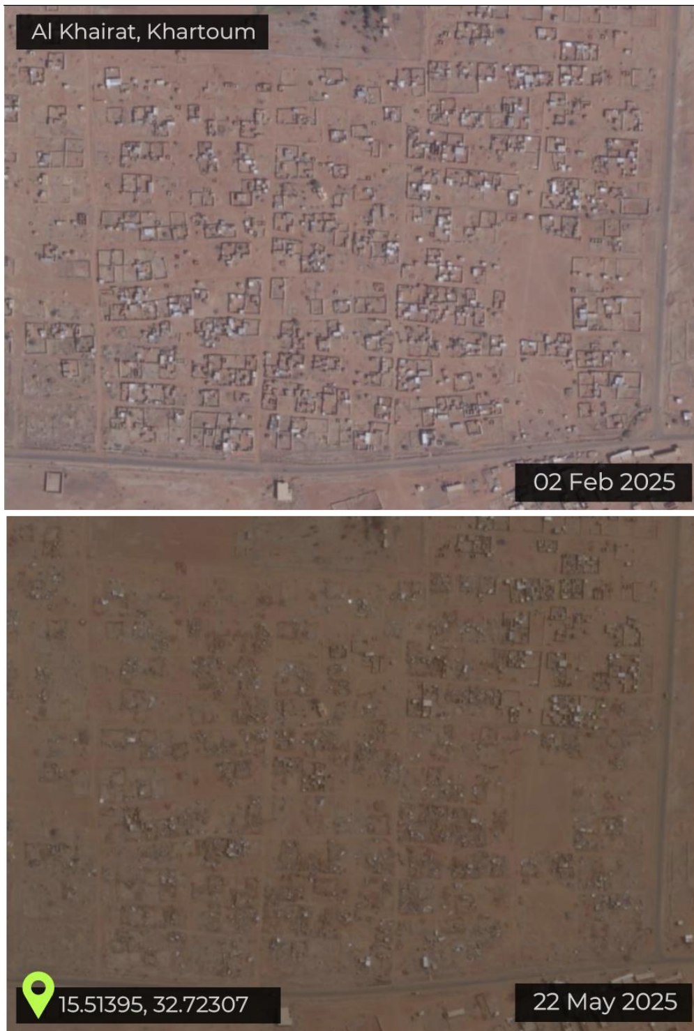
Figure 3: High-resolution satellite imagery from 2 February and 22 May showing destruction in the Al Khairat neighbourhood, Khartoum [15.51395437045896, 32.72307073359245]