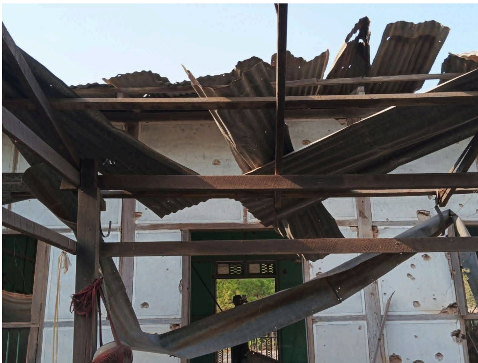
Figure 5: Myanmar Witness analysed the roofing of the external area at [22.557952, 95.583810], which shows indications of a potential aerial attack, due to the inversion of the roofing structure.

Damage patterns identified in the imagery include an inward-collapsed roofing at [22.557952, 95.583810], but without significant burn marks (figure 5). This type of damage is consistent with an aerial blast rather than an incendiary impact, which is common in Myanmar's conflict.