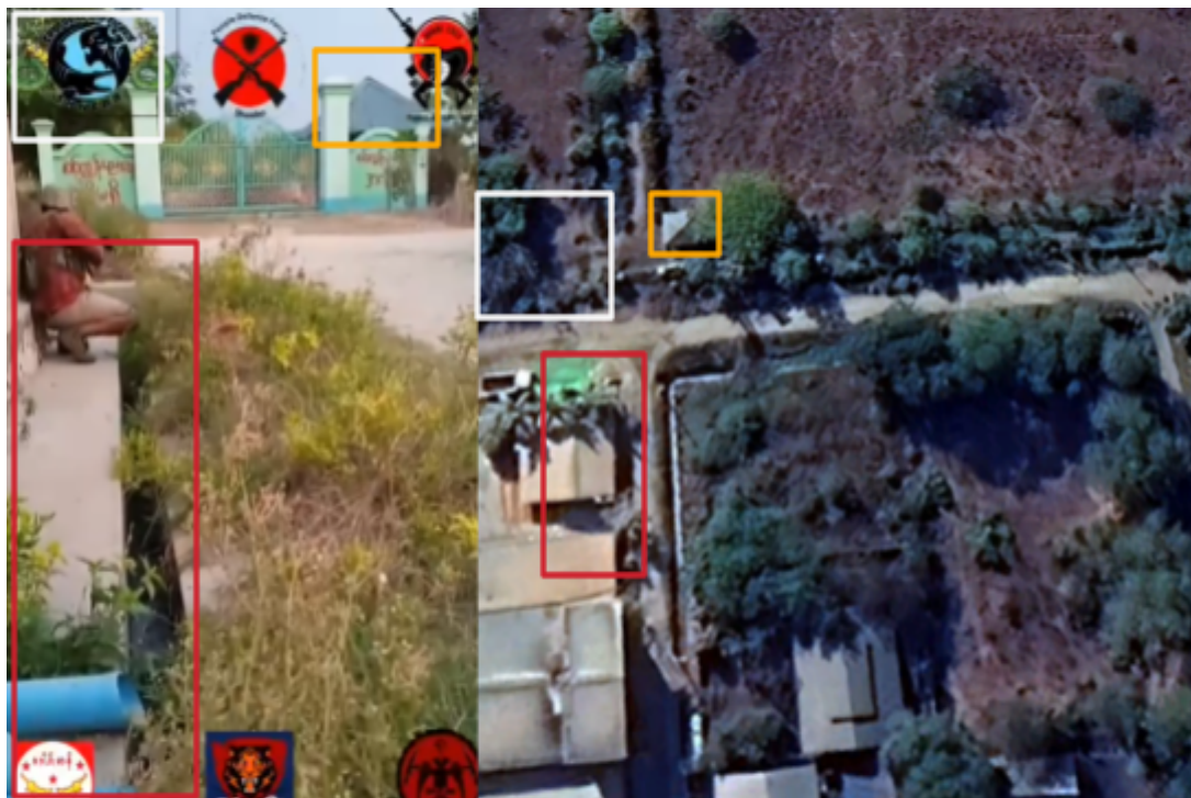
Figure 10: Myanmar Witness geolocated UGC of People's Defence Forces members taking cover and firing weapons at around [22.549201, 95.583977].