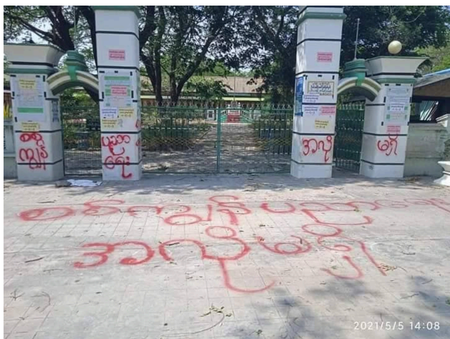
Figure 8: Myanmar Witness geolocated UGC of protest graffiti on the walls of Seik Khun Basic Education High School at around [22.547349, 95.584420].