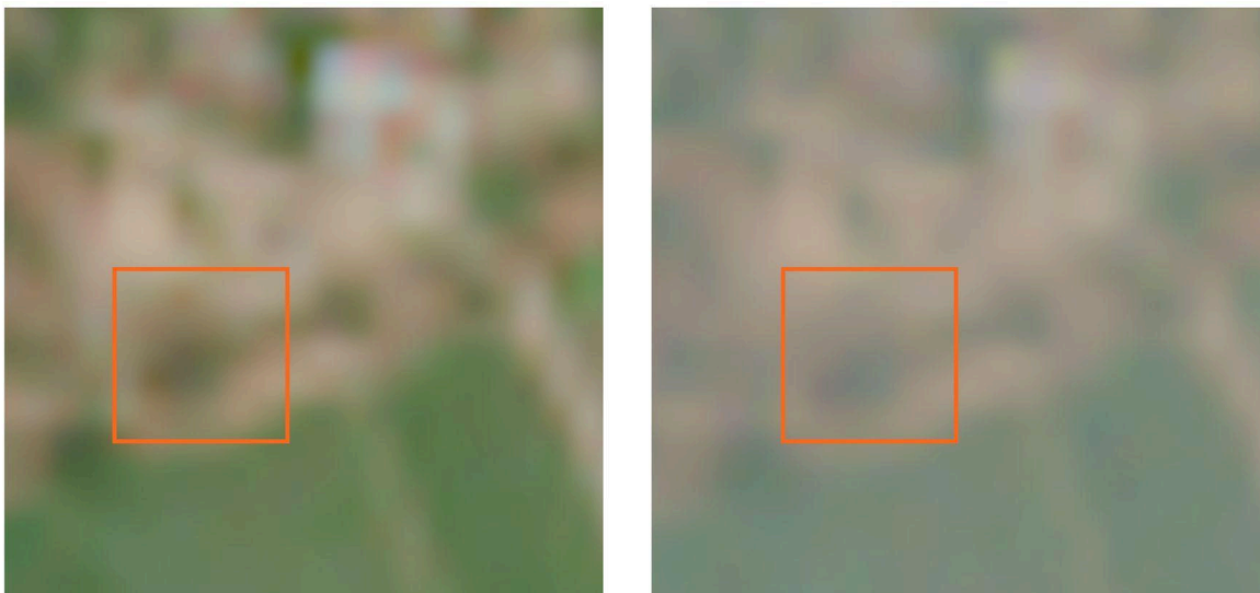
Figure 4: Myanmar Witness analysed low-resolution Sentinel-2 imagery from the Copernicus browser, but the difference is insubstantial to qualify as a confirmation that any ground changes