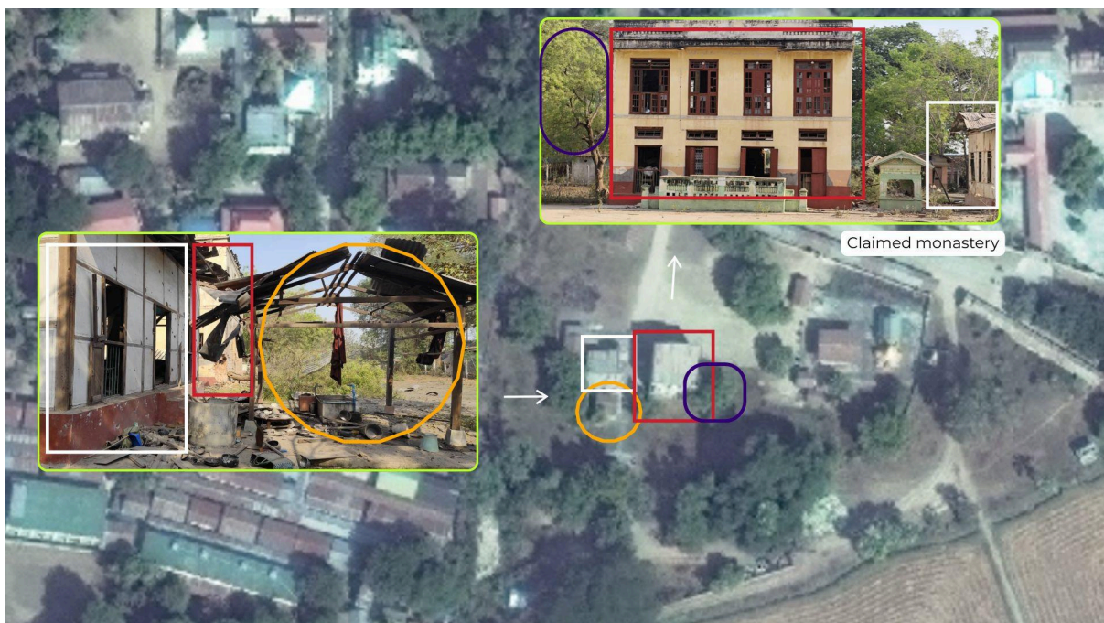
Figure 1: Myanmar Witness geolocated the monastery tied to the Seik Khun incident and cross-referenced with UGC.

Myanmar Witness geolocated several images to the northern Seik Khun village, at [22.557946, 95.583952], aligning with the location of the claimed monastery compound (figure 1). Key sites analysed include a damaged internal building at [22.558029, 95.583815], showing tea tables among the debris, as well as an external shaded area with what appears to be monks' robes hanging from a beam at [22.557953, 95.583804], and perimeter walls breached at [22.558501, 95.583812] (figure 2).