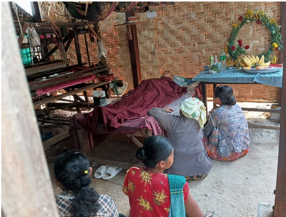
Figure 7: Myanmar Witness analysed an image of an allegedly deceased monk, which was published after the reported incident. (Source: Mandalay Free Press via Facebook).

Mandalay Free Press published an image of an alleged deceased monk, which was published after the reported incident; however, at the time of writing, it lacks full verification, and Myanmar Witness could not confirm whether this image can be tied to the event (figure 7).