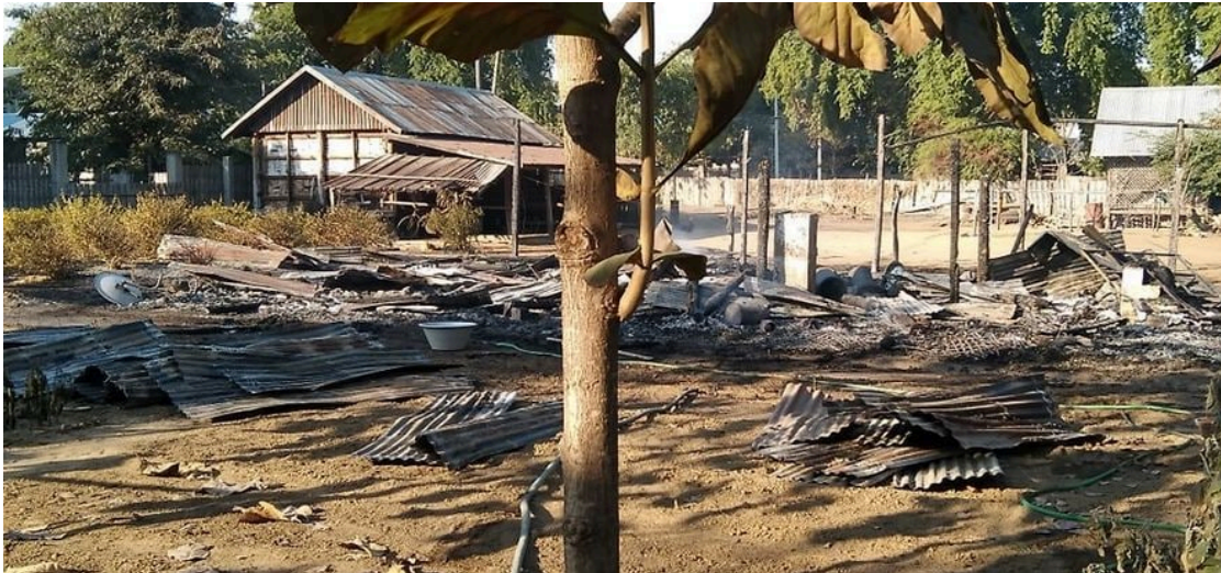
Figure 9: Myanmar Witness identified images alleged to have been associated with the DVB report of Myanmar military setting fires to civilian homes in Seik Khun in February 2022. Myanmar Witness has been unable to geolocate these videos at the time of reporting. (Source: redacted for privacy).