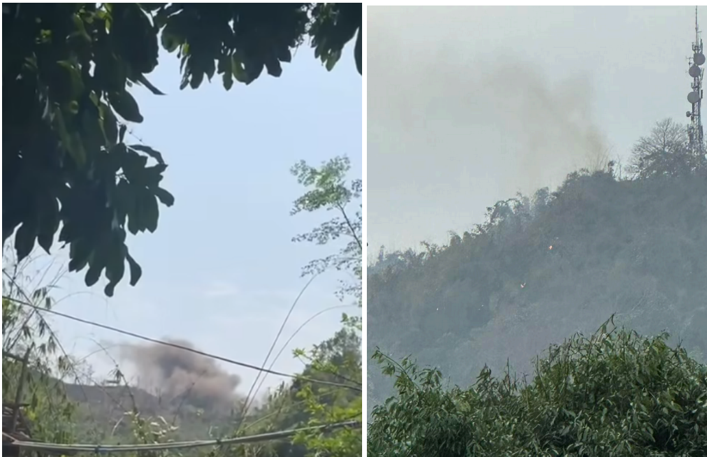
Figure 11: UGC claiming to be from the incident in Hpakant Township on the eve of Thingyan. (Source: [Left] Mizzima , [Right] Kachin News Group ).

Mizzima reported two fighter jets dropping five bombs near Ma Shi Ka Htaung prayer hill (မရှိကထောင်ဆုတောင်းတောင်) at around 13:00 local time on 13 April 2026. This was reportedly followed by a drone strike two hours later. Myanmar Witness observed smoke plumes rising from a mountain in UGC, and this is consistent with explosions or fires in a known Kachin Independence Army (KIA) area (figure 11). This also follows Irrawaddy's claims of military detentions at Hpakant hospital on 23 April 2026, and bodies left as a result of alleged post-interrogation by the military, as stated by Mizzima .