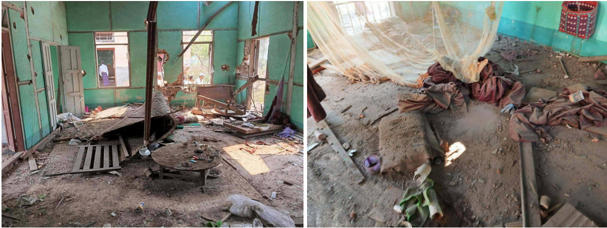
Figure 6: UGC reportedly from the Seik Khun incident demonstrates damage to the inside of a building [22.558029, 95.583815], tea tables and robes are observed among the debris.

Mandalay Free Press published an image of an alleged deceased monk, which was published after the reported incident; however, at the time of writing, it lacks full verification, and Myanmar Witness could not confirm whether this image can be tied to the event (figure 7).