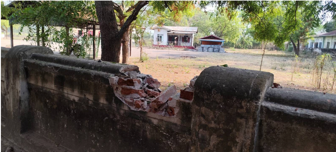
Figure 2: Myanmar Witness geolocated images of damaged walls at the compound at [22.55850], 95.583812].

These findings align with visual markers, such as signage and layout, from Red Peacock and Karenni People's Voice 's reporting, and thus rule out misattribution. Additionally, the clustered damage pattern identified suggests there was a single impactful event focused on the main structure, and this is consistent with eyewitness accounts of a targeted airstrike captured in local reports.